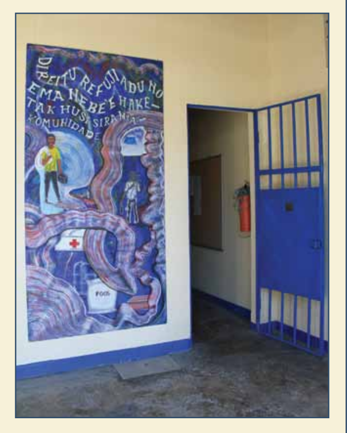
Public art outside the prison cells at Comarca Balide, Dili.

In 2000, various political parties and civil society organizations agreed that a reconciliation and truthseeking process was necessary to move Timor-Leste towards long-lasting peace. Established by Regulation 2001/10, The Timor-Leste Commission for Reception, Truth and Reconciliation (CAVR) mandated by the United Nations Transitional