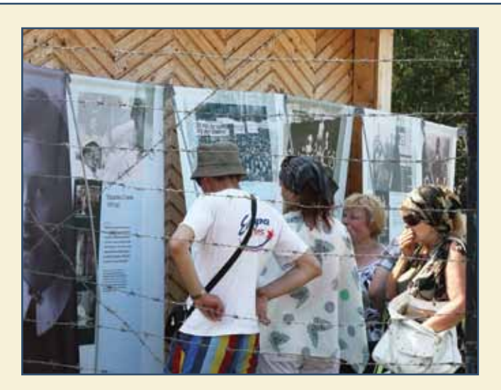
Visitors to the Gulag Museum at Perm-36.

Throughout more than seventy years of the Soviet regime's existence, until its demise in the late 1980s, political dissent in the Soviet Union was a crime. At the height of purges against real and perceived enemies of the State under Stalin in the 1930's an elaborate system of forced-labor camps integrated into the country's economy - the GULAG - was established. A forced-labor camp outside of Perm in the Ural Mountains on the cusp of Siberia and known by its code name Perm-36 was one among thousands of such GULAG camps established under Stalin. Today, the GULAG Museum at Perm-36 is the only Soviet-era labor camp to be preserved as a historic site and Museum in Russia. The prison camp at Perm-36