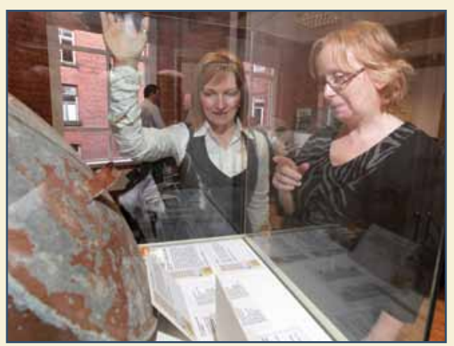
A viewing of the "Everyday Items Transformed by Conflict" exhibition by Healing Through Remembering, Belfast.

Since the 1960's Northern Ireland has been plagued with violence, colloquially known as 'The Troubles.' The fault-line for the conflict relates to the constitutional status of Northern Ireland. questions of whether Northern Ireland should remain a part of the union of Ireland or a part of Great Britain. The conflict has played itself out along religious lines between a mainly Protestant unionist community supporting British rule and a largely Catholic nationalist community supporting an independent Ireland. 'The Troubles' marks the period from 1960's to 1998, ending with the Belfast Good Friday Agreement. The Peace Agreement included the declaration of a ceasefire by paramilitary organizations, the decommissioning of IRA weapons, police reform and a withdrawal of British troops from the streets of Belfast. While