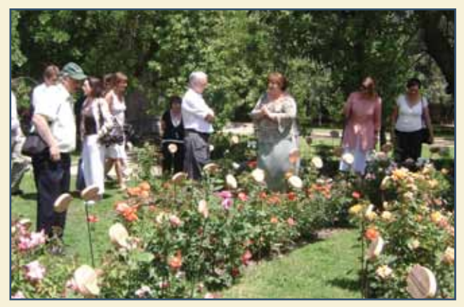
The rose garden at Villa Grimaldi Peace Park dedicated to the women held at the site.

In September 1973, a violent coup d'état ended then-president Salvador Allende's government and established a right-wing state in Chile. Democratic institutions across the nation were closed and replaced by a brutal military dictatorship, launching a campaign of repression and systematic elimination of opponents to the state. Thousands of citizens were detained and "disappeared" while others survived the clandestine centres of detention and torture during the 17-year period of state terrorism. One such site was Villa Grimaldi, the estate of a wealthy family in Peñalolén, a quiet suburb of Santiago. Hidden from view by tall stone walls, and containing a number of separate buildings of different sizes, the estate's architecture