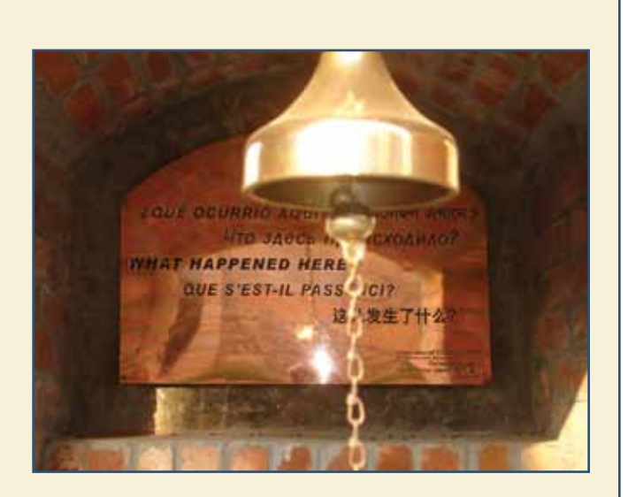
A plaque at the memorial to the killing fields asks "What happened here" in six languages.

Bangladesh emerged as an independent state in December, 1971 after nine-month long bloody war of liberation sparked off by the denial of democratic electoral verdict by the Military Junta of Pakistan. The West Pakistani military rulers opted for a kind of "final solution" of the Bengali people's struggle for national and democratic rights and resorted to genocidal attack on the population of Eastern Pakistan. The nation had to pay a high price for their victory with three million deaths, ten million people leaving their home to seek shelter in India and 200,000 women made victims of sexual violence. The war-devastated country embarked upon the reconstruction process but was struck soon by another disaster. In August, 1975 the founding father of the nation and