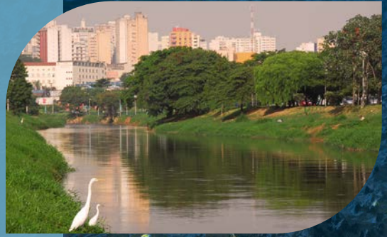
Sorocaba River - Photo: Paulo Ochandio