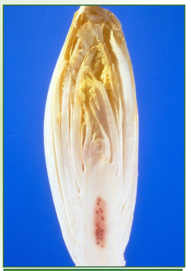
Photo 51: Reddish discolouration of the tissue of the axis - Limit allowed Class II