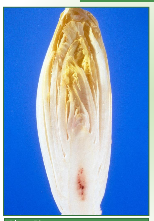
Photo 50: Slight reddish discolouration of the tissue of the axis – Limit allowed Class I