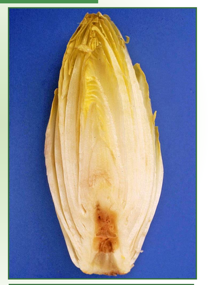
Photo 51: Reddish discolouration of the tissue of the axis – Limit allowed Class II